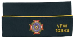
Ft. Knox Style